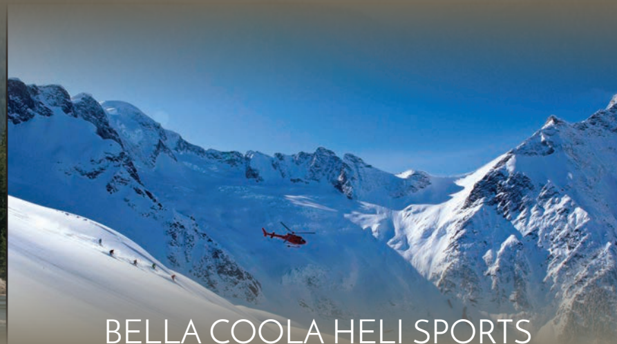
BELLA COOLA HELI SPORTS

Ski amongst towering rugged peaks, dramatic glaciers, gladed tree runs, and giant alpine bowls. Experience pristine powder in the most stunning terrain imaginable! Our expert team will safely guide you on the small group heli-ski adventure of a lifetime. And at the end of the day return back to our luxurious lodge for the ultimate in pampering!